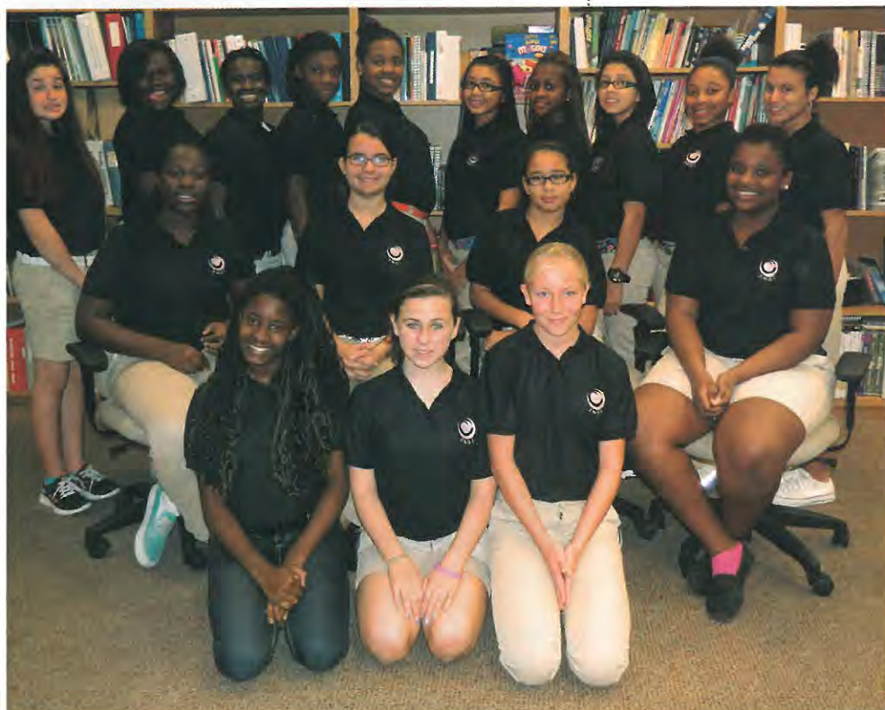
2012-2013 JWOI MENTEES

One-on-one time with the mentees develops bonds, and the group sessions foster relationships and confidence in a social setting.